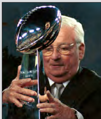
Owner Art Modell - 2000 Super Bowl XXXV

In a magnificent effort showcasing thrilling performances by their defense, offense and special teams units, the Baltimore Ravens win Super Bowl XXXV with a 34-7 victory over the New York Giants. Allowing the Giants a meager 152 total net yards, New York's attack crosses midfield just twice, while Baltimore's "D" posts 4 INTs. LB Ray Lewis is named the game's MVP, capping an accolade-filled season in which he was also tabbed the NFL's Defensive Player of the Year.