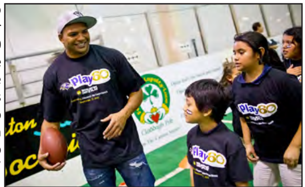
LB Brendon Ayanbadejo

For the past three years, the Ravens have made an extra effort to celebrate Hispanic heritage in the Baltimore community through their annual Hispanic Heritage Clinic. In conjunction with the NFL's Play 60 movement, Nickelodeon, the American Heart Association and the Mid-Atlantic Dairy Association, players, cheerleaders and mascot Poe join close to 200 children, ages 5 to 11, from Hispanic youth groups and organizations – such as EBLO and Centro de la Comunidad – to provide a football clinic with games, prizes and a raffle to win tickets to the Ravens' Hispanic Heritage game.